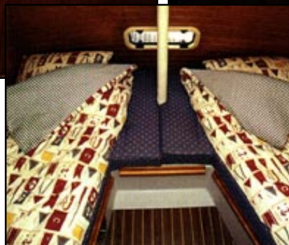
• right: Aft cabin with double bunk and enough headroom to sit upright