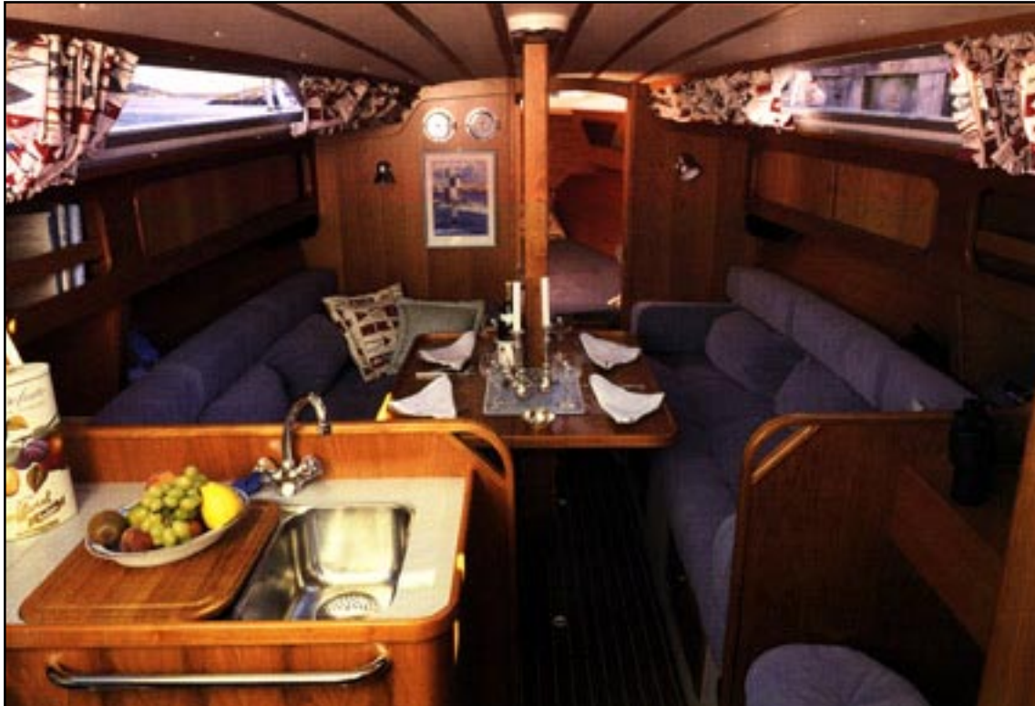
• Space, elegance and function in the saloon