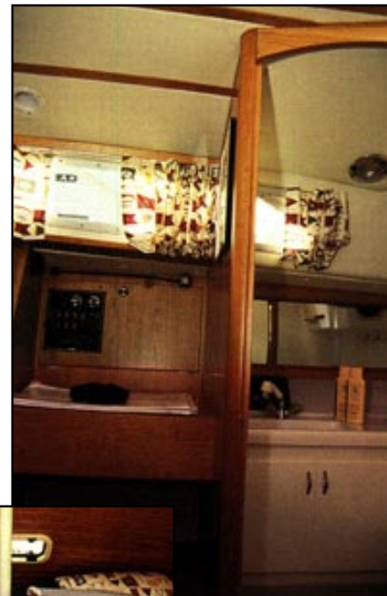
• above: Functional head compartment complete with shower