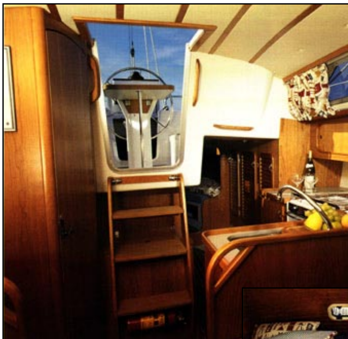
• Access to aft cabin